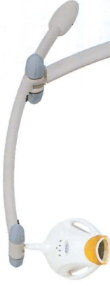
NEW Zoom!® Whitening Lamp

A: During the procedure, patients may comfortably watch television or listen to music. Individuals with a strong gag reflex or anxiety may have difficulty undergoing the entire procedure.